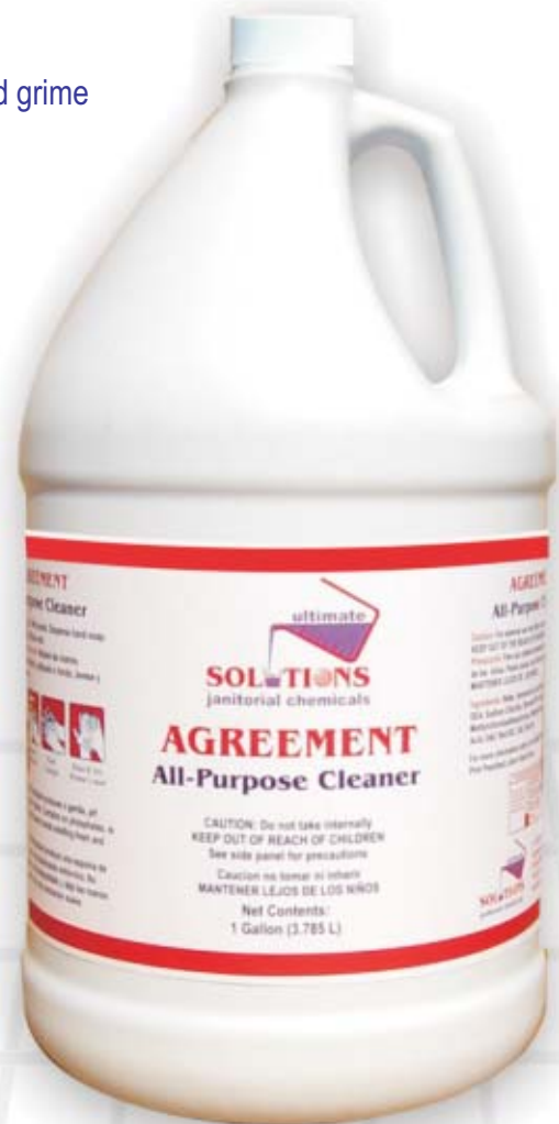
Case of (4) 1 gallon #AAPC-1

PUBLIC AREAS: Dilute product at 1:8 and spray onto, waiting room furniture, seats, ashtrays, elevator walls and floors. Rinse with water, sponge and bucket, and wipe dry.